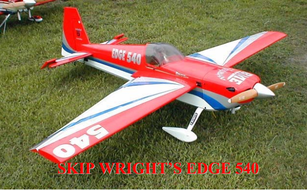
SKIP WRIGHT'S EDGE 540